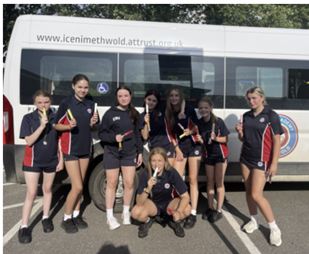
The U15 girls' rounders team