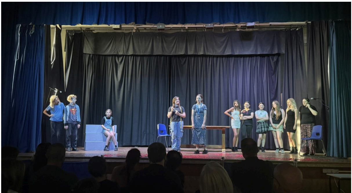
The cast of 'Living with Lady Macbeth', this year's production.